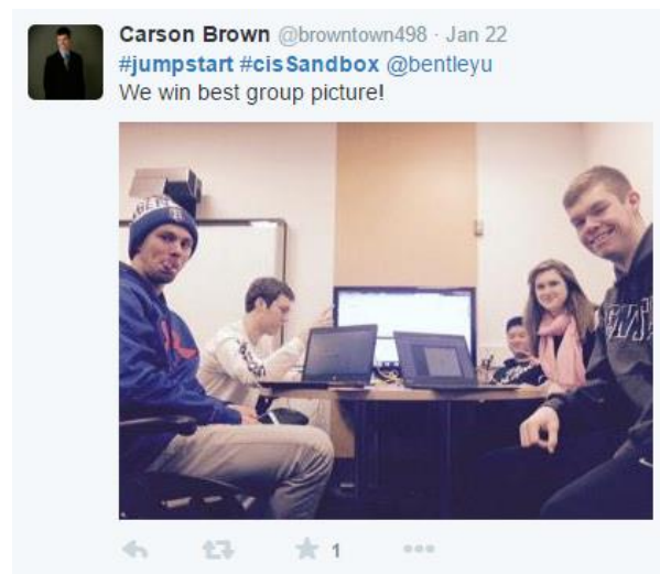
Figure 3. Tweeting a group photo after the JumpStart session.

3, that one student Tweeted during their session.